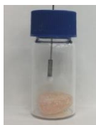
Sample 1 (whole)